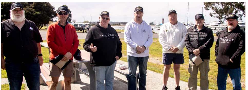
Photo: Mates supporting mates. Community and volunteers come together to enjoy a chat and a bbq.

Recently, The Man Walk and Mr Perfect invited community members to come together for a chat and a BBQ here in St Helens. It was a small gathering, but the connections made were invaluable. With wellbeing a strong part of our Council's mission, we hope this event inspires more regular catch-ups for the men in our community. It's all about creating a supportive space where everyone feels comfortable to connect and share. A big shout out to the men who turned