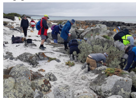
Photo: Volunteers clearing sea spurge.

The Irapuna Community Weekend was organised with support from Wildcare Friends of Irapuna Coast, Parks and Wildlife Service, Tasmanian Walking Co., Break O'Day Council, Aboriginal Land Council Tasmania, and Wildcare Tasmania. It was also part of National Science Week 2024, supported by Inspiring Australia with a Tasmanian National Science Week Engagement Grant for shuttle buses.