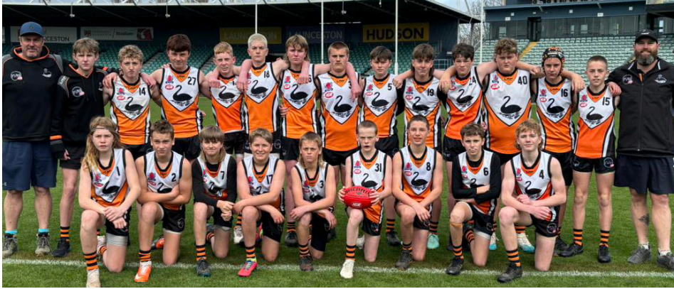
Photo: East Coast Swans- The under 14 boys with their coaches at UTAS Stadium.