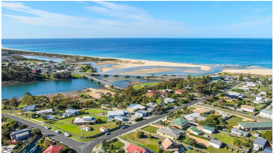
Photo: Our beloved little coastal town of Scamander has been recognised as a tiny town to visit.

Scamander has just earned the impressive No. 2 spot on Airbnb's Tiny Towns Guide, a list showcasing Australia's top 50 small towns with populations under 3,000. Airbnb's mission with this guide is to put tiny towns on the map and help them shine, and Scamander is definitely in the spotlight.