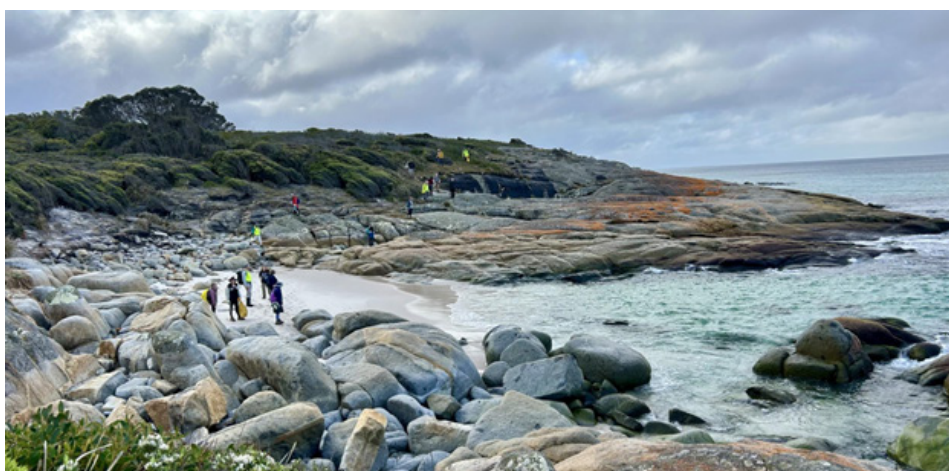
Photo: Volunteers gather at the Irapuna coast line.

In August, 130 dedicated walkers came together for the annual Irapuna Community Weekend, covering 50 kilometres of the beautiful Irapuna coast from Wukalina / Mt. William National Park to The Gardens. Over four days, participants not only enjoyed the stunning scenery but also helped care for it.