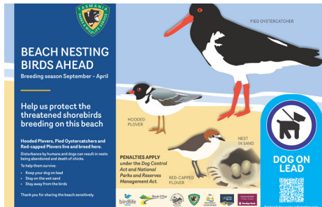
Photo: These signs will be displayed at our beaches.. dog-prohibited zones.